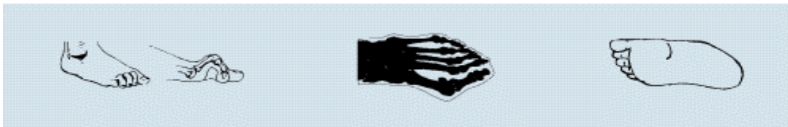
Toe Deformities (Hammer/Claw Toes)

Indicate foot deformities listed or specify the type and date of amputation(s). The more serious deformities are illustrated below. Prominent metatarsal heads are evidence of major deformity such as midfoot collapse.